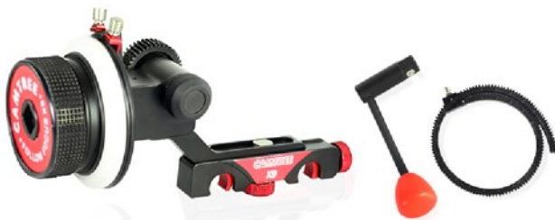
Camtree X9 Follow Focus