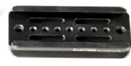
Sliding Base Plate