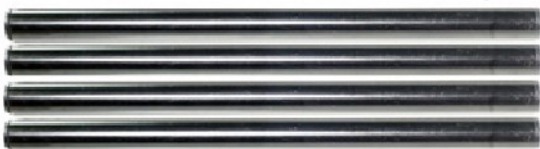
4x 300mm Female Rods