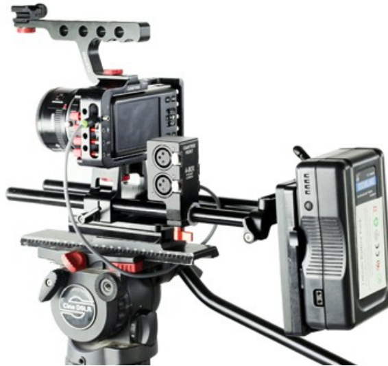
(SHOWN WITH OPTIONAL ACCESSORIES)